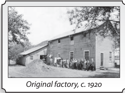
Original factory, c. 1920

The window shade business grew through two world wars and a depression. Today, Draper offers lines of window shades for the commercial, educational, and residential markets, and is one of the country's largest manufacturers of window shades.