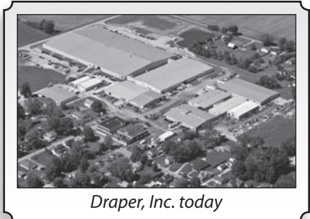
Draper, Inc. today

Draper was proud to receive the 2009 Business of the Year award from the New Castle/Henry County Chamber of Commerce, and in 2010 Draper was one of only seventy companies (and one of only two manufacturers) named one of the "Best Places to Work in Indiana" through comprehensive reports and employee surveys compiled by the Indiana Chamber of Commerce.