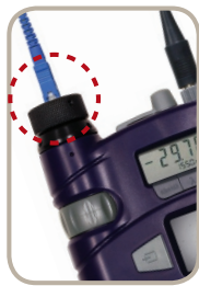
1 INSPECT PATCH CORD

To promote systematically adopting proactive inspection, JDSU developed the proactive inspection model “Inspect Before You Connect,” which promotes the visual inspection procedures and pass/fail criteria set forth in the IEC-61300-3-35 visual inspection standard. By guiding technicians with varying levels of expertise in the proper implementation of proactive inspection, the addition of this model to fiber handling essentials ensures that proactive inspection is performed correctly every time.