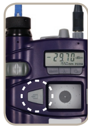
2 ACTIVATE PROBE