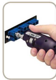
3 INSPECT BULKHEAD