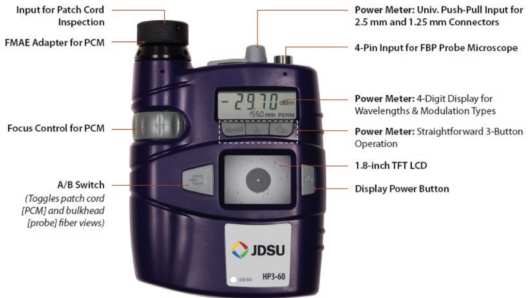
JDSU HP3-60 System with Integrated Power Meter and Patch Cord Microscope (FIT-HP3-60-P4)

Designed to facilitate quick, easy inspection of the connector end face, the HP3-60 integrates an OPM with a video inspection monitor, a probe microscope, and patch cord microscope.